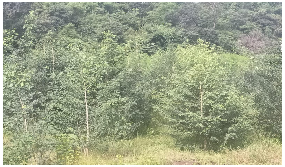
For GPIII CL