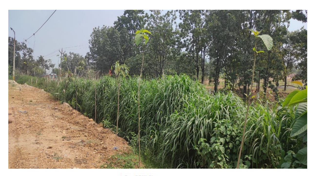
For GPIII CL