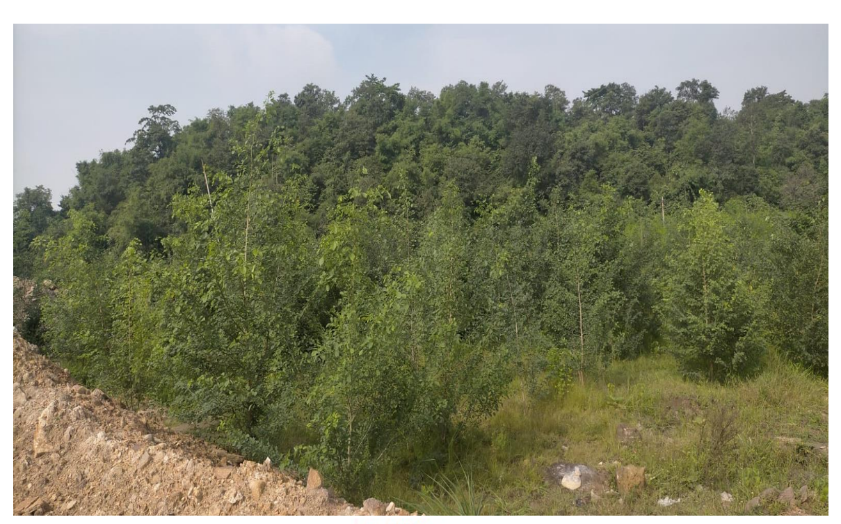
For GPIII CL